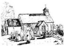
St Winfrith's, East Dean