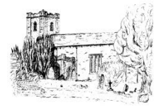
St Peter's, West Tytherley