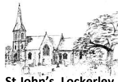
St John's, Lockerley