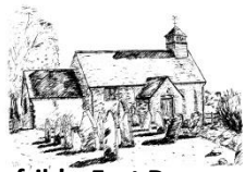
St Winfrith's, East Dean