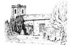
St Peter's, West Tytherley

In this year's Church Calendar most of May is 'Easter' (which ends at Pentecost on 24 th May). Churches are bright, cheerful and beautiful – often filled with flowers.