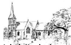
St John's, Lockerley