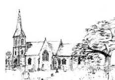
St John's, Lockerley