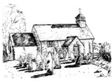
St Winfrip's, East Dean