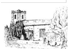
St Peter's, West Tytherley