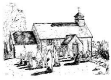
St Winfrid's, East Dean