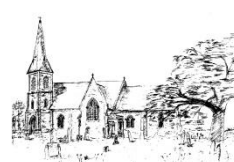
St John's, Lockerley