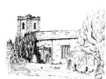
St Peter's, West Tytherley

The week before Easter (3 rd to 7 th April) is called Holy Week and is there to help people prepare for Easter. In our churches we are planning for: