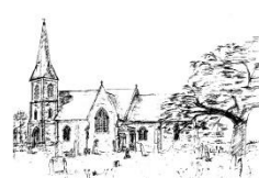
St John's, Lockerley