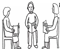
OTHERS CHOOSE TO CARRY OUT ACTS OF PENANCE

Rich Inheritance - Jesus' legacy of love (a course for all denominations and those curious about Christianity). Please contact me for Zoom details. On 10 th April there is to be a Confirmation Service for those who want to be confirmed (4pm in St Leonard's, Sheffield English). Confirmation is a special church service in which a the promises that were made when they were baptized).