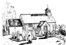
St Winfrith's, East Dean St Peter's, West Tytherley