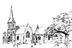
St John's, Lockerley