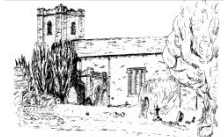
St Winfrith's, East Dean Peter's, West Tytherley