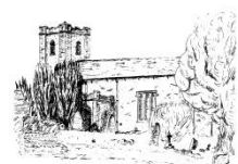
St Peter's, West Tytherley