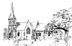
St John's, Lockerley