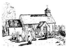
St Winfrith's, East Dean