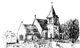
St Peter's, East Tytherley