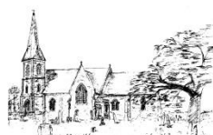
St John's, Lockerley