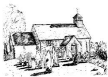
St Winfrid's, East Dean