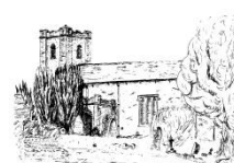
St Peter's, West Tytherley

The Churches in our Benefice were beautifully decorated for Harvest Celebrations – I hope that you managed to see some of them! Lots of food was taken to Trussell Trust Foodbanks – thank you. November is a time for remembering... Each year it is often the custom to hold a service (near to All Souls' Day, 2nd November) at which we remember those who have died, particularly those who have died recently. For Remembrance Sunday (12th November), there will be a wide selection of events to help us remember – there is certain to be one near you.