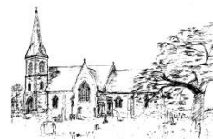
St John's, Lockerley