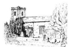
St Peter's, West Tytherley