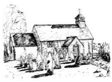
St Winfrith's, East Dean