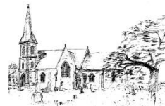
St John's, Lockerley