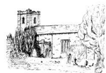
St Peter's, West Tytherley

At Harvest we also try to give some food to needy people. This year, again, our parishes and schools are supporting the Romsey Foodbank, part of the Trussell Trust ( www.romsey.foodbank.org.uk ). In the last years, thousands of people received 3-day supplies of food and necessities. In the cost-of-living crisis there are many more families in need.