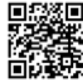
QR Code for Facebook Page