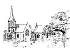
St John's, Lockerley