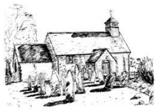
St Winfrid's, East Dean